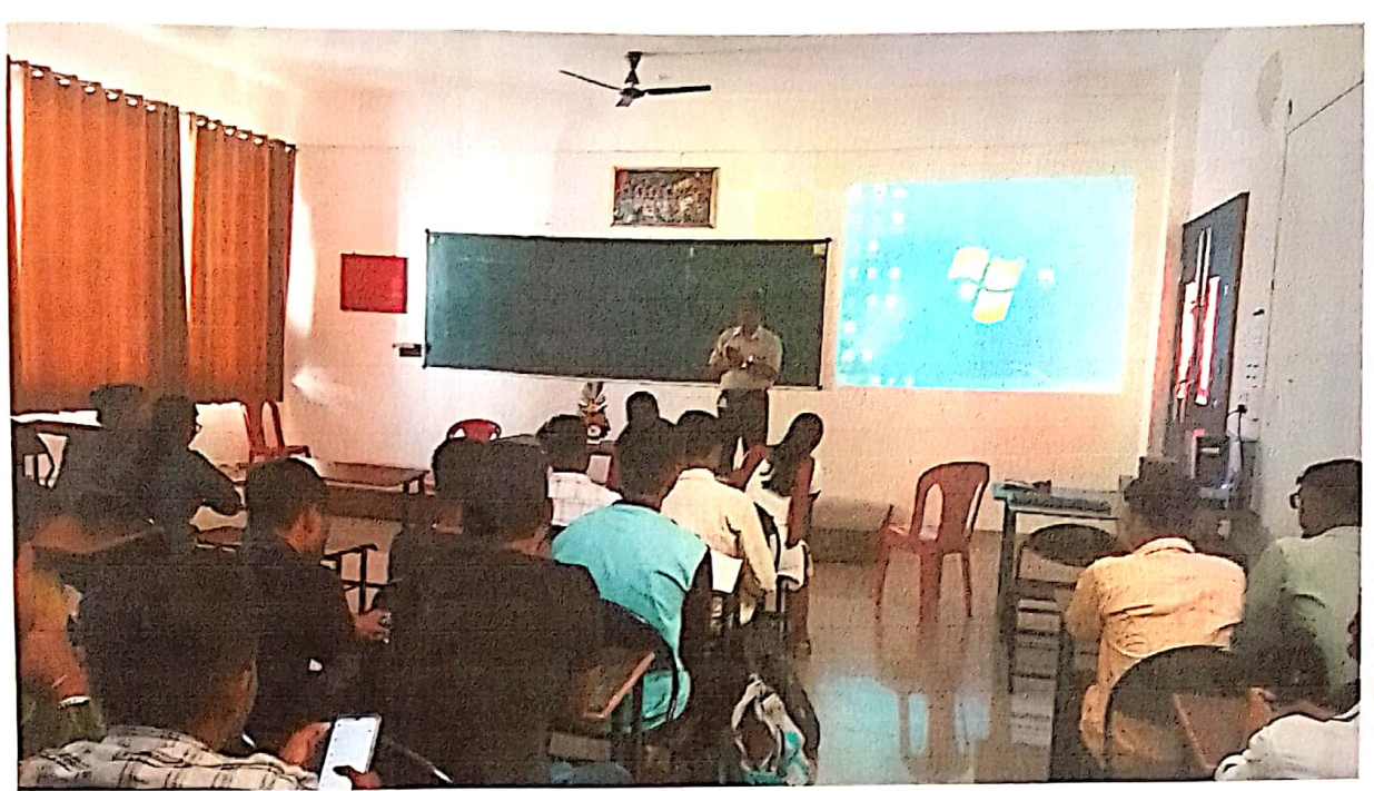
(Juest lecture on microcontroller at seminar hall (18 keb 2019)