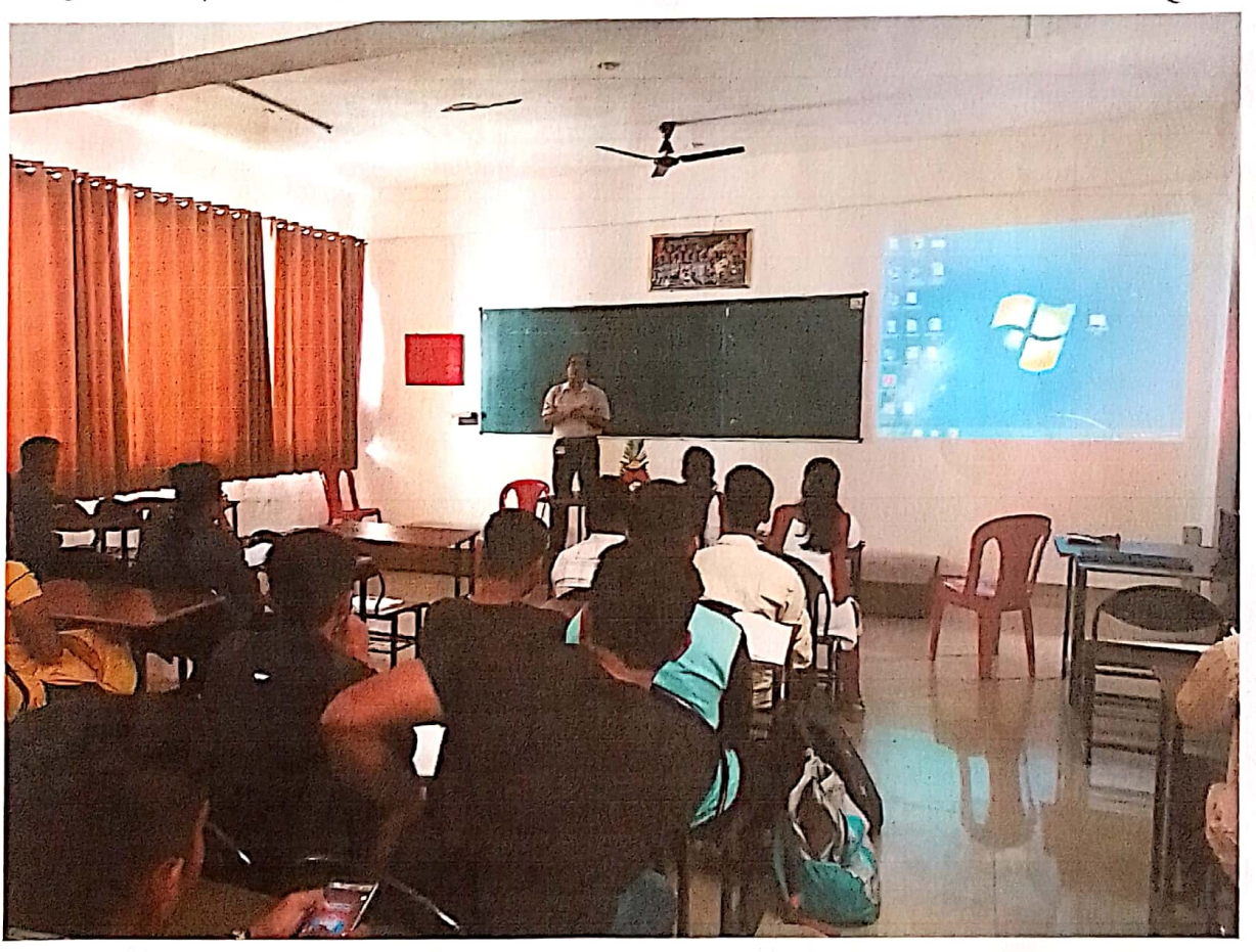
auest lecture on microcontroller of seminar hall (18 feb 2019)