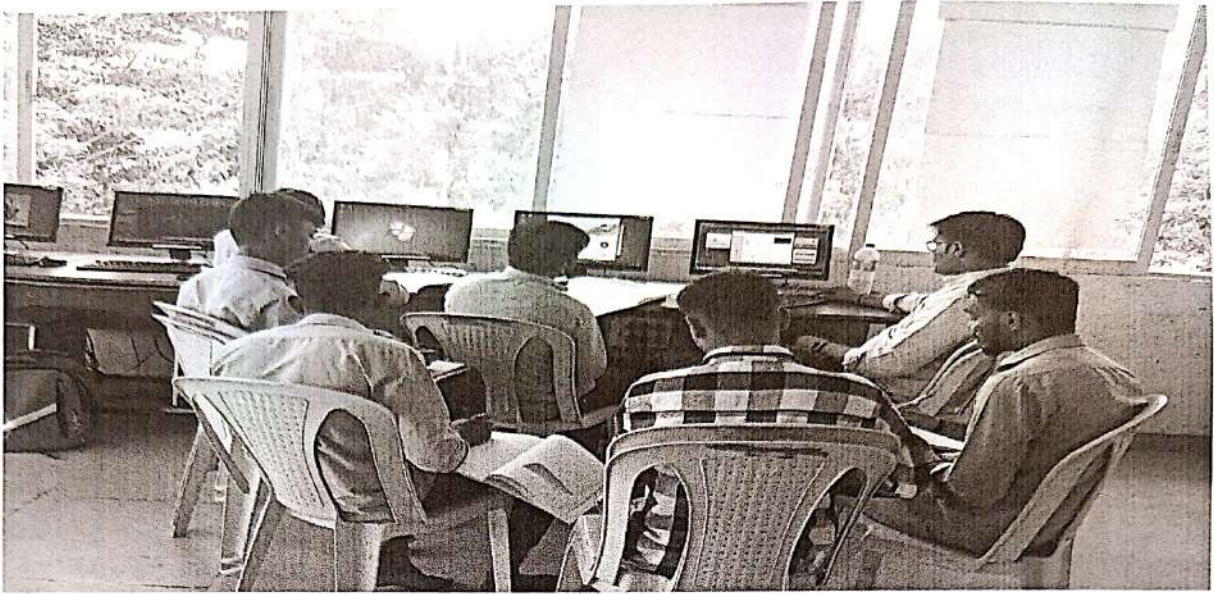
*Add On Course on ETAB -Pic. 01*