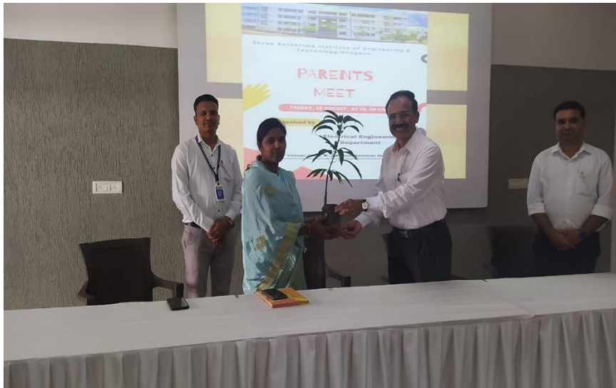
Felicitation of Parents Representative by Principal Sir