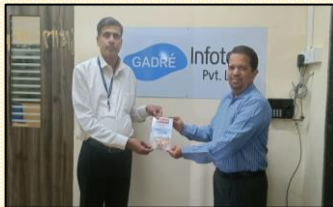
Gadre Infotech Private Limited, Ratnagiri