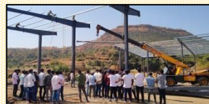
Joshi construction plant, Satara.