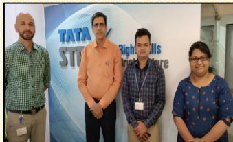
Tata Strive Skill Development Centre, Pune