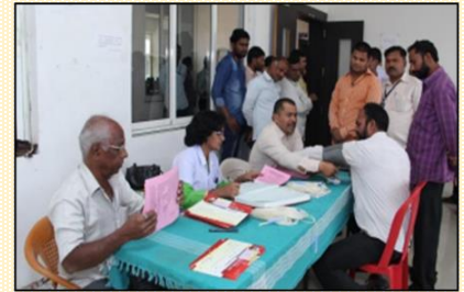
Blood Donation Camp – 16th Jan 2018