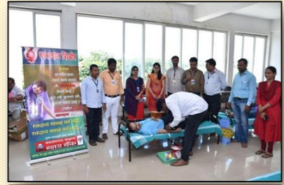
Blood Donation Camp – 7th Dec 2022