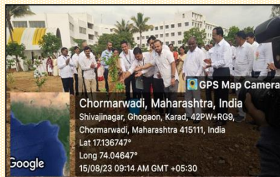
Tree plantation – 15th Aug 2023