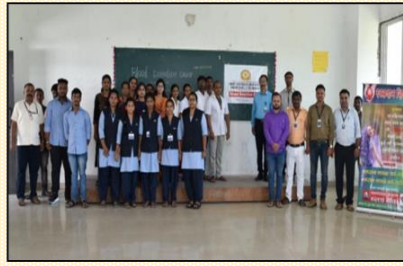
Blood Donation Camp – 1st Oct 2019