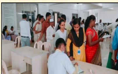
Health Checkup Camp I – 7th Aug 2023