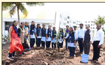
Tree plantation – 23rd Sept 2019