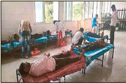
Blood Donation Camp – 15th Oct 2021