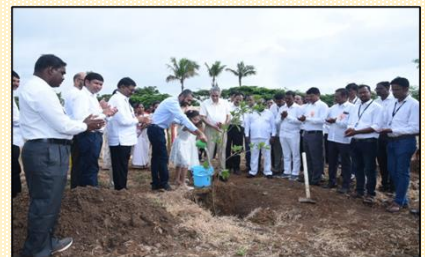
Tree plantation – 15th Aug 2022