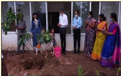
Tree plantation – 15th Aug 2020