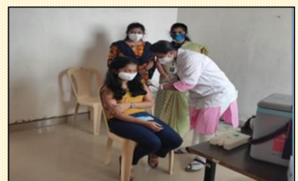
Vaccination Camp II – 28th Oct 2022