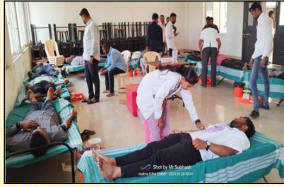
Blood Donation Camp – 20th March 2024