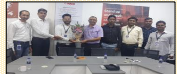
Setco India Pvt Ltd, Pune.