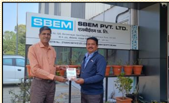
SBEM Private Limited, Khedshivapur