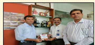
Waychal construction Pvt Ltd, Pune.