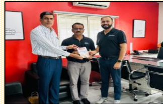
Friction Welding Technologies Pvt Ltd, Pune