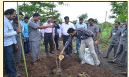
Tree Plantation – 25th Nov 2018